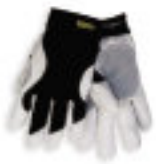
Tillman Truefit Glove Goatskin Part #: 1470-Size (S-2XL) Price: $13.00/pair