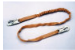
Miller Lanyard Part #: T5111 Price: $54.00