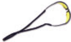
Safety Glasses Lanyard Part #: 3200 Price: $3.00