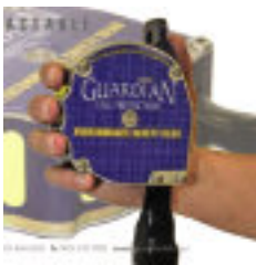
11' SRL Part #: 10900 Price: $157.00

KONE Inc. reserves the right to alter design and specifications without prior notice. KONE is a registered trademark of KONE Inc.