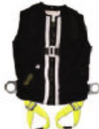
Black Tux Harness Part #: 02620 Price: $216.00