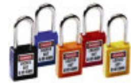
Masterlock Keyed Different Red Part #: 410KD-R (Red) Price: $12.00