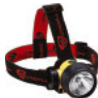
Yellow Trident Headlamp Part #: 61050SL Price: $36.00