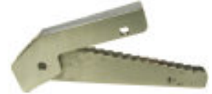
Door Stop Part #: Door Stop Price: $31.00