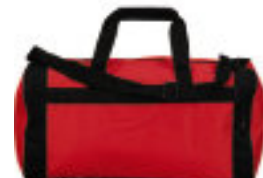
Corvest Duffel Bag (Black) Part #: 5122 Price: $17.00