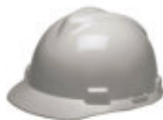
MSA Vgard White with Ratchet Suspension Part #: 475358 Price: $16.00