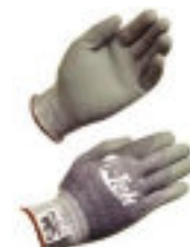
Nitrile Coated Cut Resistant Glove Part #: 570-L Price: $8.50/pair