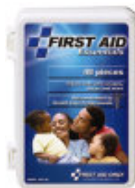
First Aid Kit Part #: FAO-120 Price: $6.00