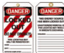
Lock Out, Tag Out Tags Part #: MLT407-CTP Price: $15.00/pack of 25