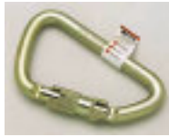
Caribiner 1" Throat Opening Part #: 17D-1 Price $39.00