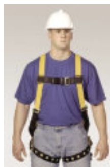
Miller Titan Harness Part #: T4500 Price: $62.00