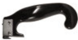
FCJ Flat Cable Stripper Part #: 36-135-M1 Price: $69.00

KONE Spares 325 19th Street Moline, IL 61265 Tel: 1-800-343-3344 Fax: 309-743-5541 www.konespares.com