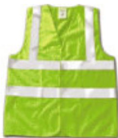
Class 2 Lime Safety Vest Part #: V7122-Size Price: $10.00