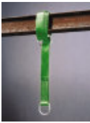
Miller 6ft Cross Arm Strap Part #: 8183 Price: $49.00