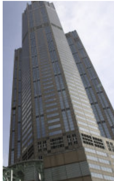
311 S. Wacker Chicago, Illinois

This technology has successfully been installed in over 10,000 elevators nationwide known as Miprom 21.