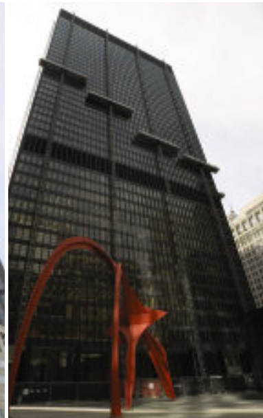
John C. Kluczynski Chicago, Illinois